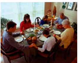
Apostles' teaching, fellowship, breaking of the bread, and prayers