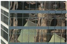
Designed and led by the Congregational Development Consultants of the Diocese of Colorado

This workshop is for clergy and key leaders in your congregation who have the desire and ability to leverage change and develop your congregation over a period of time. Participants should be ready to engage today's cultural changes as challenges of being an effective witness of the Gospel and participating in God's mission.